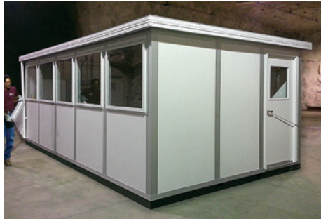
Oversized 12x20' exterior building shown. All Booths under 8x20' are shipped at standard rates.

InPlant's Booths, Guard Shacks, Control Rooms, Operator Cabs and Security Shelters are prefabricated in the factory, wired and shipped fully assembled. They are designed for easy shipping – all Booths under 8' by 20' ship at standard rates. Larger Booths require